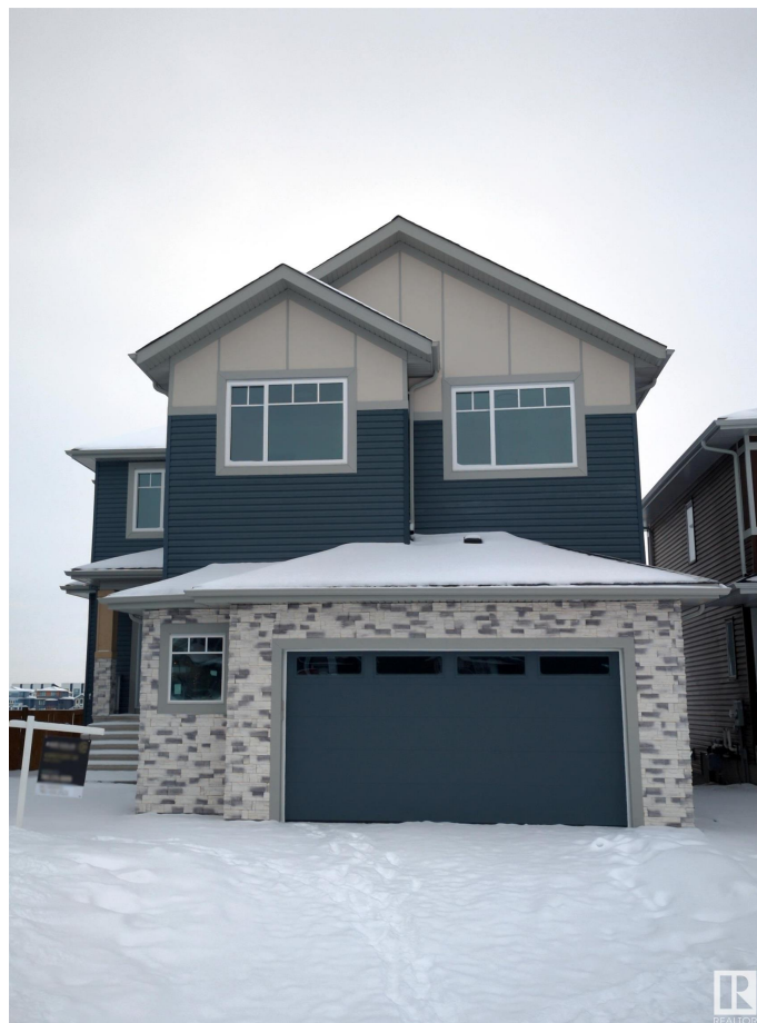
91 Edgefield Wy, St. Albert, AB

2 Storey 2,848 +/- SF on a Walk-Out lot onto the Pond. Fully fenced and Landscaped Plus 1,193 +/- SF Bsmt developed. TOTAL 4,041 +/- SF developed. Designed for family enjoyment plus large gatherings! Enjoy tranquility watching the Sunset over the pond. Covered deck off Dining Room, Primary Suite and at ground level patio. Huge Spa style Ensuite - separate water closet. Double vanity. Invigorate in the spa shower or relax in the huge soaker tub. 3 additional Bedrooms on the same floor all with 4 Pce Bathrooms. Plus, main floor den/bedroom with adjacent full bath. 5th Large Bsmt. Bdrm. Large Kitchen Plus a full 2nd Kitchen. Entertain guests in the Living Room while others relax in the Bonus Room overlooking the Great Room or bsmt family room c/w wet bar w bar stool height island or enjoy the games room. Open design allows flow of natural light thru-out. Store your toys™ in the oversized garage. Access to the Park/Pond/Pathways. Major Shopping, Schools, Recreation Facilities, Major/Minor Arterial Roads